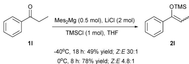
Scheme 3 Deprotonation of propiophenone using Mes 2 Mg.

In order to probe the stereoselectivity of enol ether formation with Mes 2 Mg, propiophenone was employed as a suitable and well-known substrate. 17 As shown in Scheme 3, the favoured Z-isomer remained predominant throughout, with an optimum 30 : 1 ratio of stereoisomers being achieved at -40 °C, compared